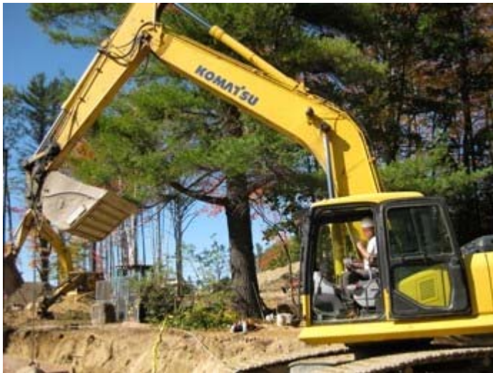
Photo: Dan Gilligan of Hutter Construction spends a beautiful fall day in an excavator helping to bring additional water lines onto the MCH campus.

Since September, several changes have taken place on the MCH campus and more are planned for the next eight to ten weeks. We'd like to share the details with you.